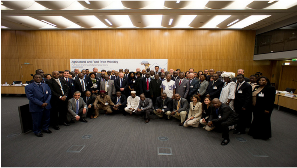
Participants at OECD/SWAC Conference on “The Impact of Settlement and Market Trends on Food Security” (Paris, 27-28 October 2011)