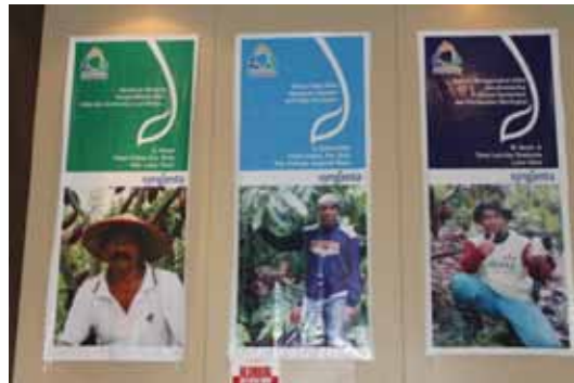
➤ Grower testimony poster

Indonesia Cocoa grower Conference – Side grafting technology user Jan 26, 2011