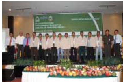
➤ Establish 100 key growers as a member of the community

Indonesia Cocoa grower Conference – Side grafting technology user Jan 26, 2011