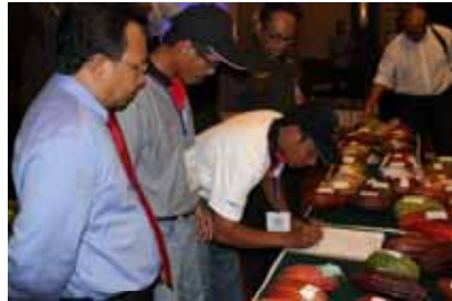
➤ Sign off the forum of Cocoa high productivity community