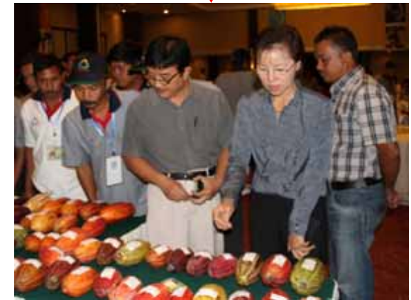
➤ Cocoa Fruit contest