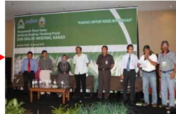
➤ Seminar with multi topics (Productivity, Pest & disease, Agronomy practice, Government support, Syngenta technology)