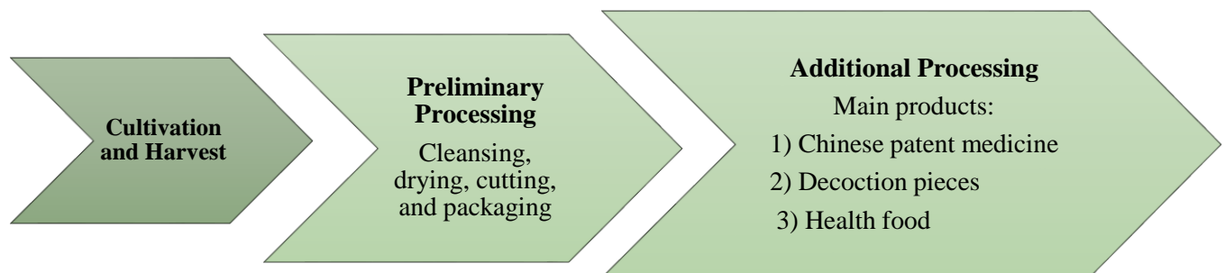
Diagram 1: Production and Processing of CMH

There are around 11,146 different varieties of CMH, both wild and cultivated, scattered across China. 6 The government has promoted cultivation of CMH; over 200 species of CMH have become highly commercialized with demand over one thousand tons. 7 The production and processing of CMH can be summarized in 3 main steps, as illustrated by Diagram 1 below.