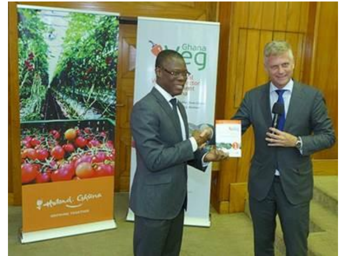
Minister of Agric and NL Ambassador launching Business Opportunities Report